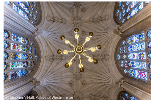
St Stephen's Hall, Palace of Westminster