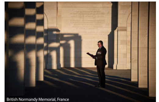
British Normandy Memorial, France