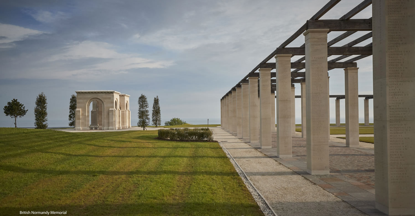
British Normandy Memorial